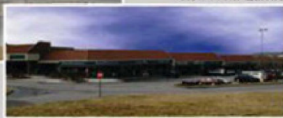
View From College